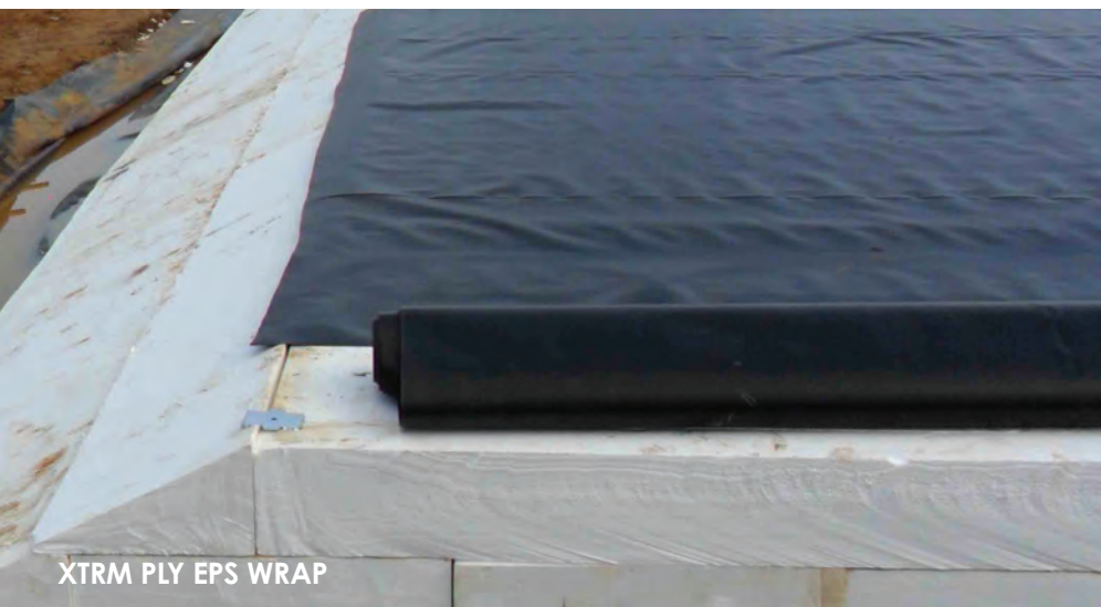
XTRM PLY EPS WRAP